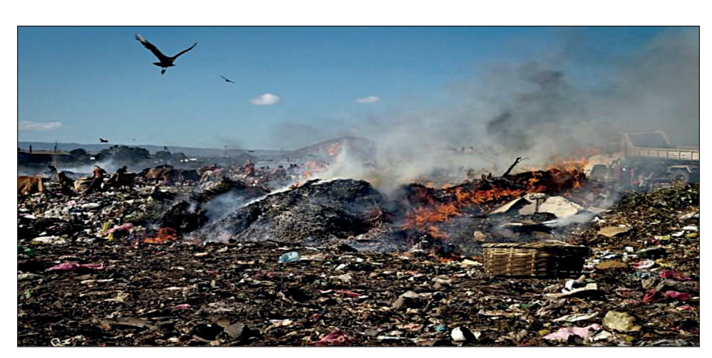
Figure 1. Scene of open burning of unsorted wastes in southwest Nigeria

The studies on the extent and compositions of municipal wastes in Nigeria have been reported by several authors [12, 14]. A few studies on anthropogenic air pollutants from combustion of municipal solid wastes in Nigeria also exist in the literature [2, 15, 18]. However, the studies by these authors were limited in scope based on the number of pollutants and study areas covered. There is presently no specific study on the contribution of open burning of municipal wastes to atmospheric loading of total volatile organic compounds (VOCs), polycyclic aromatic hydrocarbons (PAHs), polychlorinated biphenyls (PCBs), polychlorinated dibenzo -p- dioxin (PCDDs) and polychlorinated dibenzo furan (PCDF) in Nigeria. Therefore, the present study examined the emission inventory of these organic air pollutants from open burning of municipal wastes in Southwest Nigeria. The study will provide the information that will further strengthen the present drive of Nigeria's Federal Government at municipal waste management.